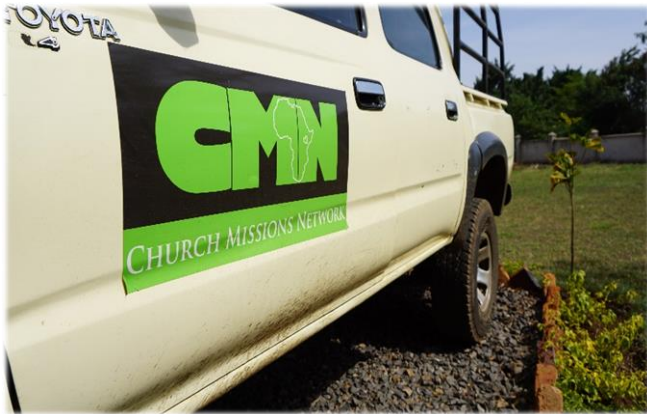
CMN delivers rice and beans to several of their churches, so they can feed the orphans and the widows

If you would like to help the team in these projects with finances or materials please contact me by sending me an email. If you don't have my email you can always fill out a contact form on our website, which can be found here: www.projectdaretodream.com/contact